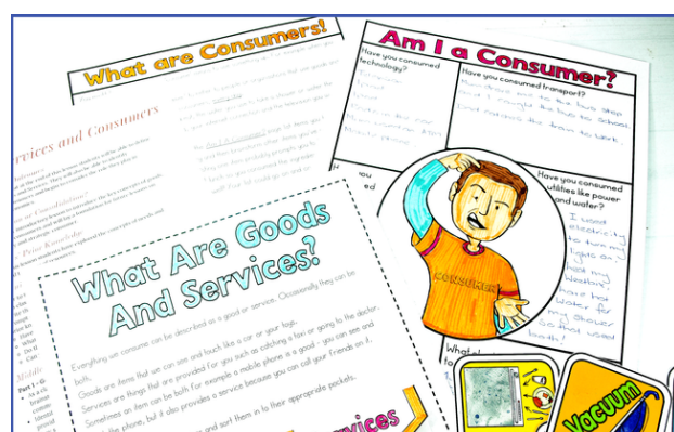
Consumers, Goods and Services