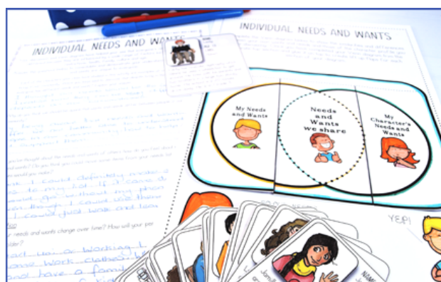
Individual Needs and Wants